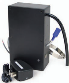
Ozotech EOG System

An ozone generator produces ozone by passing oxygen or dry air through a high voltage electrical field or corona. The O_2 bond is split, freeing oxygen atoms ( O_1 ) to repeatedly collide with O_2 molecules to form O_3 , Ozone.